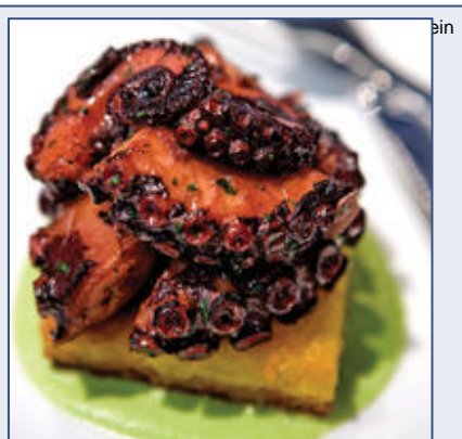
Octo-power: Drago Centro's tentacle-topped risotto

View more photos in the Drago Centro slideshow.